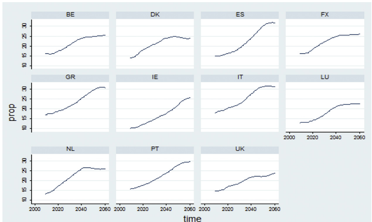
Fig. 3. Proportion of eligible voters 70 years or older. Calculations are based on Eurostat (2008).

in the Eurostat population predictions. 9 We simulate two scenarios. One where the future generations (born after 1991) have the same turnout as the youngest generation currently eligible (the post-70s generation). Another where we more optimistically assume that the future generations will have a 10 percentage points higher turnout. This will allow us to get some idea of how much change is needed to achieve a constant turnout.